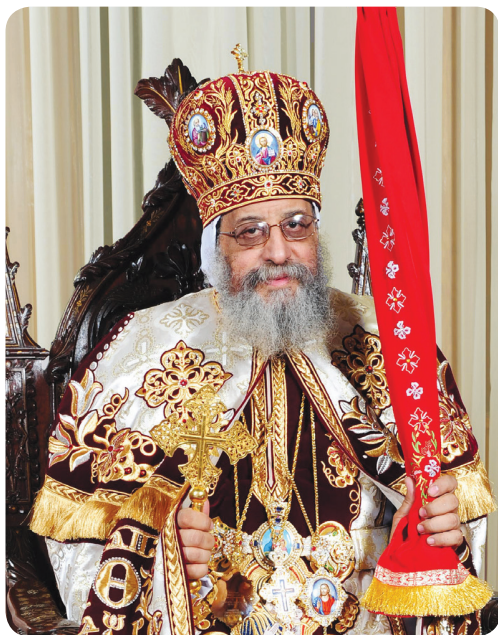
H.H. Pope Tawadros II

Pope of Alexandria & Patriarch of the See of St. Mark